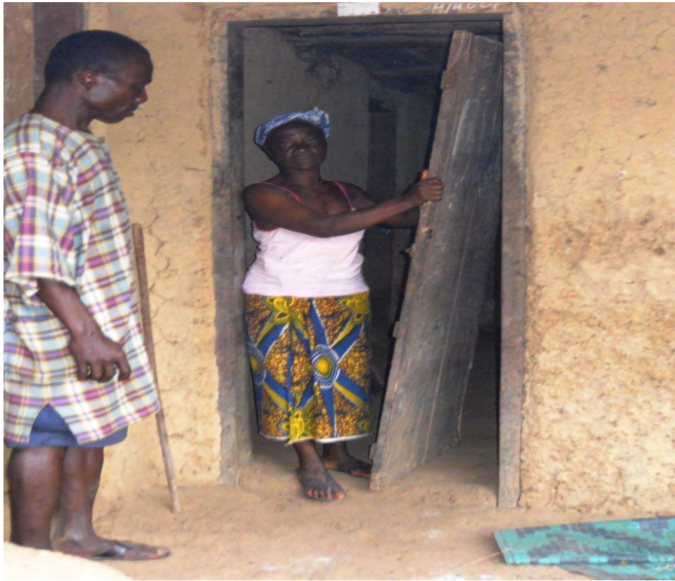
A door kicked off its hinges in Libby – a woman lamenting

In the period of investigation Green Scenery witnessed some women with bundles on their heads returning from their hideouts in the bushes they informed Green Scenery that more people were still in hiding. A returning woman told Green Scenery that “the police which should be protecting us and our property are now the cause for us running from our homes like the war days and losing our hard earned property.”