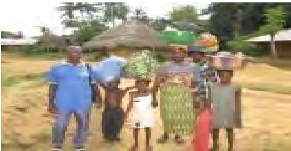
Returnees from the bush

In the period of investigation Green Scenery witnessed some women with bundles on their heads returning from their hideouts in the bushes they informed Green Scenery that more people were still in hiding. A returning woman told Green Scenery that “the police which should be protecting us and our property are now the cause for us running from our homes like the war days and losing our hard earned property.”