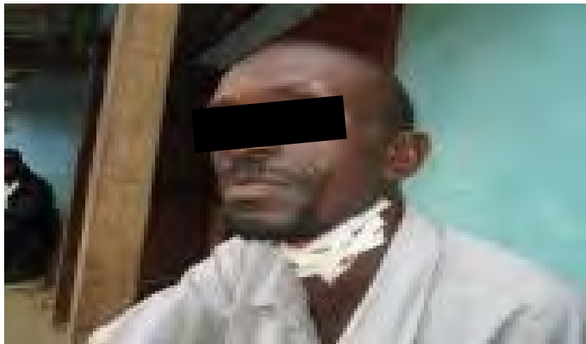
The victim with the alleged bullet wound on the neck

The Community Health Officer in Sahn informed Green Scenery that he was out of station when the incident occurred but was told that the nurses treated a number of people with wounds. He said one of them with a severe wound was the individual who was alleged to have sustained a bullet wound in the neck. He was asked whether he can confirm if the wound was in fact caused by a bullet.