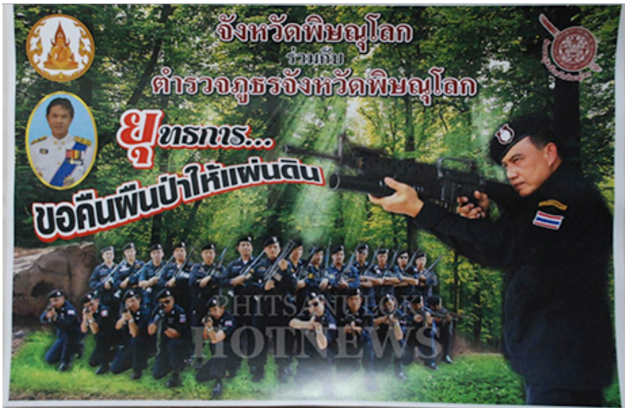
A state public

relations poster from Phitsanuloke province: "Return forests to the country."[/caption]