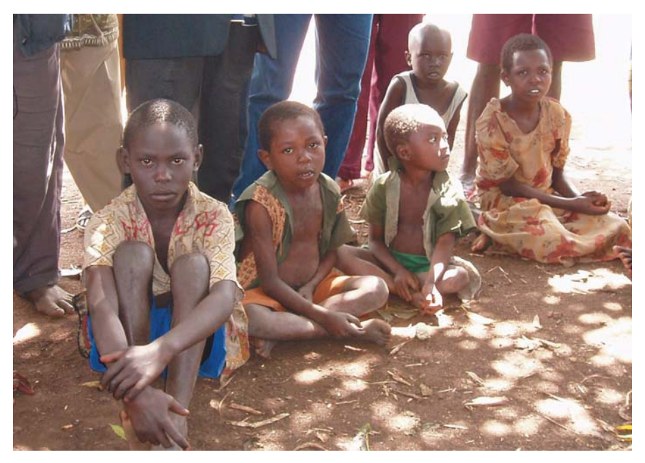
Most of the children in this village do not go to school because villagers have no money to send them.