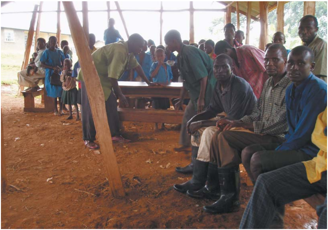
Meeting in a village near the boundary of the national park, July 2006. "We don't want the whole national park, we just want our land back."