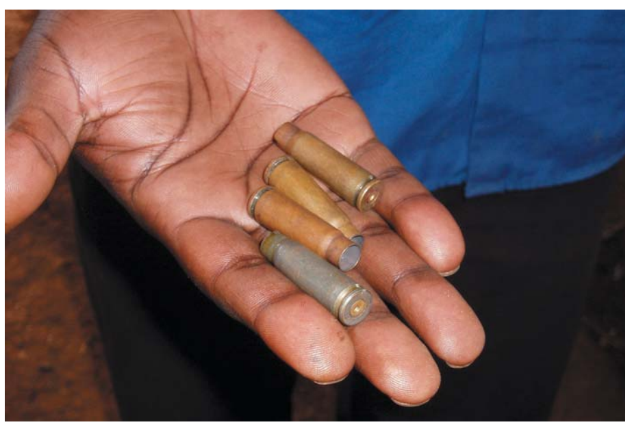
Bullet shells. "The bullets were shot by people trying to kill us," a villager told us. "Some people have died. Others have been injured."