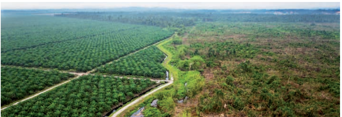
Oil palm plantation in the east of Miri, Borneo, Indonesia.

Stronger alliances among communities and organizations in consumer countries and oil palm plantation countries are needed to more effectively challenge the ongoing expansion of oil palm plantations. This will need to involve among others exposing the lies and empty promises of oil palm companies, solidarity with those defending the territories and forests on which communities in Asia, African and Latin American countries depend and that are at risk of being taken over by palm oil plantations. It will also require solidarity with those working towards different production and consumption models which are not based on further destruction of forests and peoples’ livelihoods in the global South.