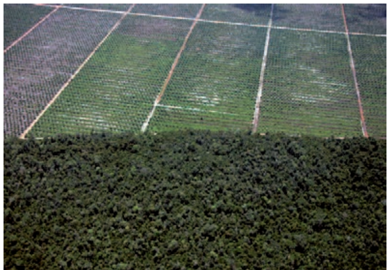
Oil palm plantations are a major cause of deforestation in Indonesia.

Oil palm companies tend to occupy the lands with the best growing conditions for their oil palm, rather than establish their plantations on “degraded lands and grasslands that have already lost their environmental and economic values as a result of intensive logging and other human activities which leave the land exposed to rain and wind erosion, thereby reducing soil productivity” 1 . Soil fertility and availability of water are key factors that determine where oil palm companies establish their plantations. Favoured lands include forests, causing large-scale forest destruction and destroying ecosystems that are fundamental in many ways for the physical and cultural well-being of the local forest-dependent populations.