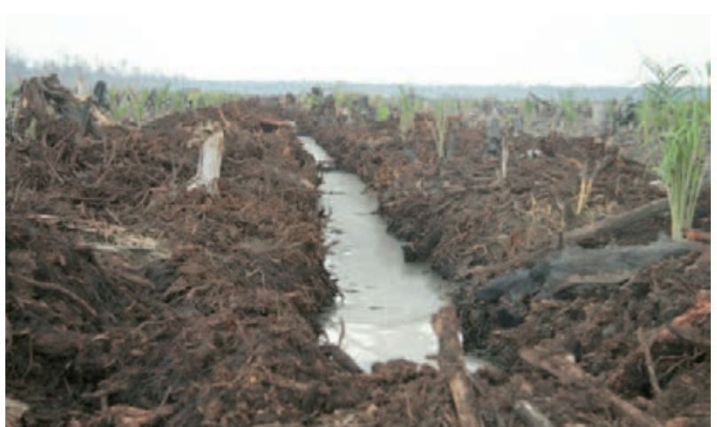
Deforested area with recently planted oil palm trees in South Sumatra, Indonesia.

Governments of oil palm producing countries and palm oil producing companies lobby at the international level to have oil palm plantations considered as forests the United Nations organization FAO still defines them as an agricultural crop. By having them relabelled as “forests”, the aim is to secure access to REDD+ 10 , CDM 11 or other ecosystem trading schemes, which could then enable the companies to generate an extra income from selling carbon credits from the oil palm plantations. However, the idea of oil palm companies receiving money for (temporary!) carbon storage in their