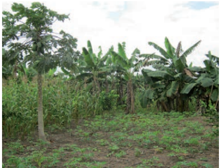
Community vegetable garden. Community of Nueva Vida, Rigores, Honduras.

Furthermore, in situations where people hand over their lands or a portion of their lands to expanding oil palm companies and receive compensation that they themselves consider adequate, the risk to food insecurity in the future remains. Continued access to their land would have enabled them to continue to grow food they now cannot grow anymore. The result is a loss of or increased risk to their food sovereignty, today and in future, and also of the region that the farmers supply with the food crops they previously grew. Taking farmland away from people can therefore mean putting people at risk of hunger if no job or work alternatives are available, irrespective of whether or not adequate compensation was paid initially which as mentioned under reply to lie 2 above, most often is not the case.