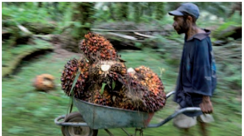
Working conditions are very precarious in the oil palm plantations.

Although the work at an oil palm plantation is still mainly manual, it cannot compete with the quantity of work and number of jobs that can be created through a diversified small-scale agriculture and (forest) land use, managed and controlled by peasant communities.