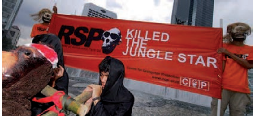
Protests on the occasion of the annual meeting of the RSPO, Jakarta, Indonesia.

The Roundtable for Sustainable Palm Oil (RSPO) has put together a set of principles and criteria which a company that wants to be certified by the RSPO needs to adhere to, to be able to claim to produce “sustainable palm oil”. However, RSPO suffers from structural problems that make it impossible to deliver this promise. The main problem is that the big global players in the palm oil sector represent the huge majority of its members. Another problem is that RSPO does not differentiate between different scales of operation, applying the same criteria to small plantations and to monocultures of tens or hundreds of thousands of hectares that by definition are never sustainable for local people and nature.