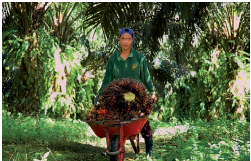
Something very common: a child working in an oil palm plantation in Indonesia. Photo: Asrian Mirza

However, the reality of the conduct of the palm oil sector in countries like Indonesia fails to substantiate these claims that oil palm companies are examples of good ethical conduct. To the contrary, the sector has been involved in cases of corruption, graft, and bribery as well as rent-seeking by politicians 26 , public and government officials. Furthermore, many cases of violence have been reported. Something very common: a child working in an oil palm plantation in Indonesia. Photo: Asrian Mirza 27 in the hundreds of conflicts with local communities that companies are involved with.