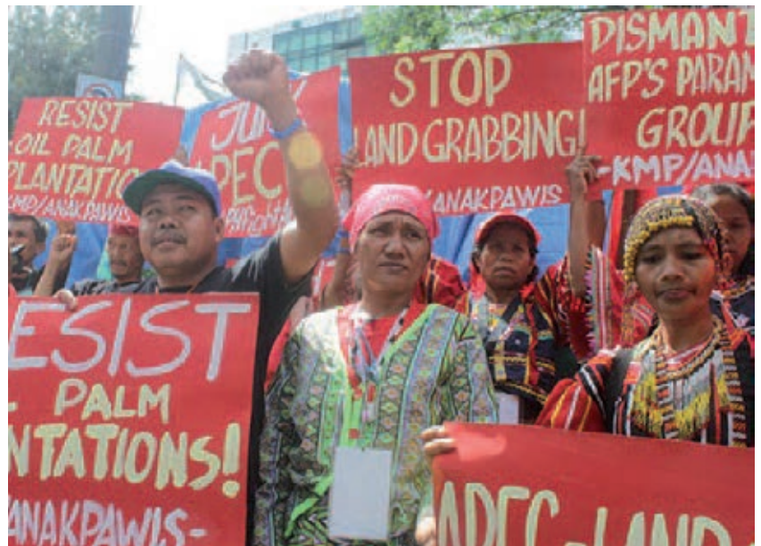
Farmers and indigenous peoples protest against plans to expand oil palm plantations, Phillipines.

So when companies are contacting communities, it is usual for them to come not to listen and learn about community demands and about how the land is already used. They come to inform the community about the company plans in the hope that communities will not hinder but rather support them. To obtain such support, companies tend to initially target community leaders, putting pressure on them to agree to and ensure local support for the plantation project, often arguing that government at the highest level already gave their support. When companies encounter resistance among leaders and communities, a tactic often used in attempting to break this resistance is to offer some kind of benefit, most often a few jobs and/or some social project for the specific community.