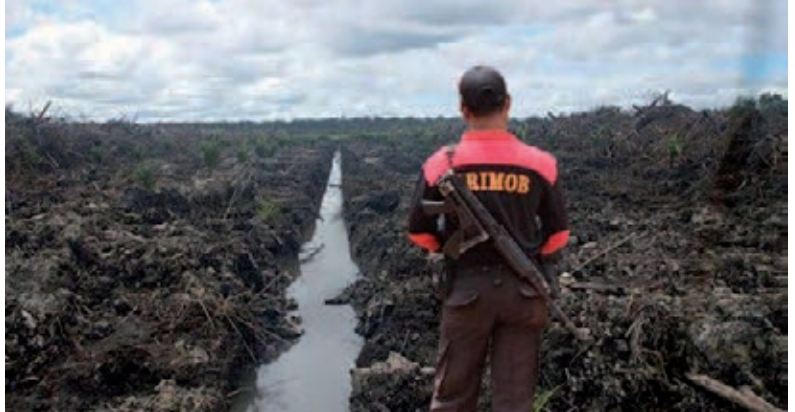
In Indonesia, oil palm companies hire armed thugs to protect their plantations.

In most cases, people who have lost access to land as a result of a large scale oil palm plantation do not receive any compensation at all. This has to do with the fact that in many countries in the global South people do not hold legal title to the lands they use and on which they have often lived for many generations. They do however hold customary rights to the land. When national governments establish rules for how to calculate such a “compensation”, these rules often exclude lands under customary use. Companies claim they provide adequate or rightful