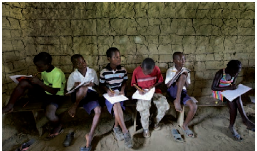
Students study in a “classroom” in Grand Bassa, Liberia, built by Equatorial Palm Oil.

At the end of the day, companies benefit more from government measures to ‘attract investment’ getting concessions for low or no fees and other advantages such as tax breaks, subsidies, loans with low interest rates, etc. - than communities benefitting from the company’s local initiatives. In Gabon for example, an agreement between the government and oil palm producer Olam includes income tax holidays for 16 years, exemption from VAT and custom duties on imported machinery and inputs, Oil & Gas and fertilisers. 21