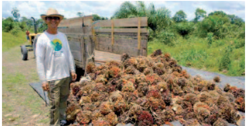
Smallholder working with BioPalma Vale, in Brazil. He is still spending more money than what he earns.

Another problem is that to establish the plantations, the smallholders assume a debt that they often have difficulties in paying back. Governments and companies tend to exaggerate the profits that the oil palm plantations can offer to local people. At the same time, they rarely properly inform the smallholders about the costs and about the risk of assuming a debt which, depending on the agreements, the smallholders incur directly or that they have to repay to the company for preparing their two hectare plots and planting the crops. The scheme practiced in Indonesia today often dooms farmers into a life of permanent debt. Many farmers lack contracts with the company and have very limited information on the financial scheme they got involved in. As the income from the two hectares is so reduced by debt repayments and other overheads, people need to complement their income with activities outside their land.