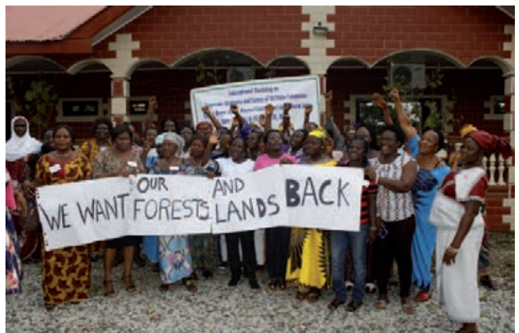
“We want our forests and lands back”, say organized women in Sierra Leone (2017)

Violence against women not only occurs when they work for the companies; women also suffer violence in their daily lives around the plantations. Companies monopolize their land, and pollute, divert or dry up the rivers. As a result, women and girls are forced to walk much farther to find water and land suitable for food production. If on their way they must walk through plantations, they are exposed to harassment and violence by security guards or policemen. In the few cases where they dare to report what has happened, impunity usually reigns. This leads to their frustration, and it perpetuates the violence. They are forced to walk in groups in order to protect each other. These are situations in