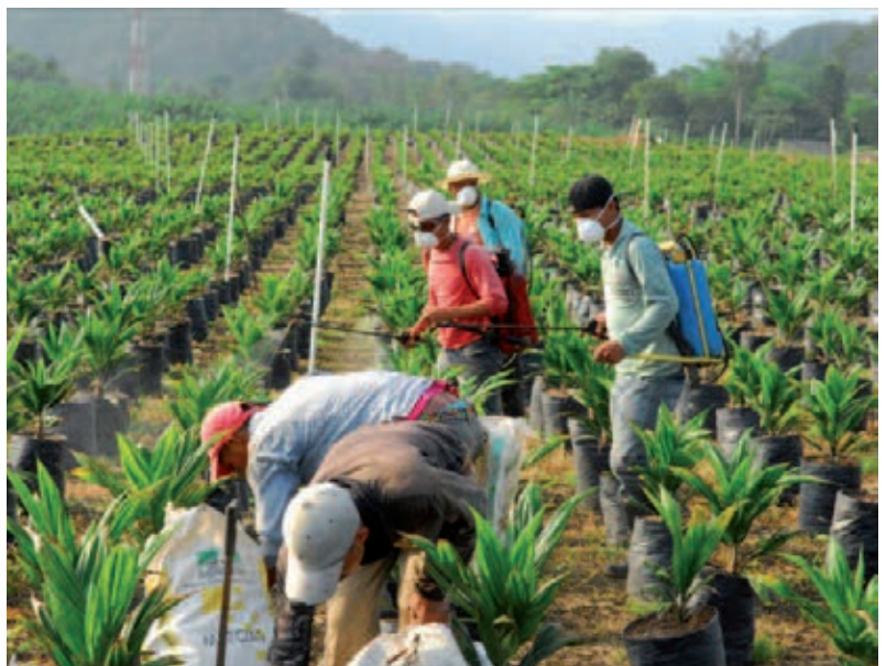
Farmworkers spray pesticides on young palm trees, department of Alta Verapaz, Guatemala.

Any large-scale monoculture depends on agrotoxins and fertilizers, in order to guarantee the high production that the companies pursue. Even the so-called “minimal” 4 quantities used cause significant impact for local inhabitants. The agrotoxins, and even fertilizers used in the plantations pollute water on which people depend. A further source of pollution are the mills where oil palm fruit is processed to obtain the crude palm oil. Rivers and streams that people use to obtain drinking water, for bathing and washing clothes become polluted with this so-called Palm Oil Mill Effluent (POME). When the plantations expand, this pollution increases along with the volume of oil palm fruit processed in the mills, often to the point where the water is not useable anymore.