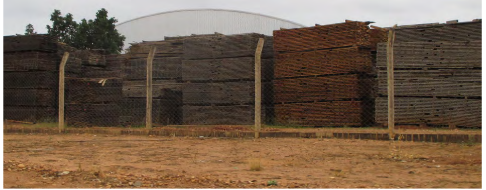
Timber company in Colniza.

uncommon in FSC certified areas and, in addition, communities that depend on forests and coexist with this "management" have questioned the supposed "sustainability" of this forest extraction land use for them. In the Brazilian state of Acre, and in other countries such as the Democratic Republic of Congo, so-called "sustainable forest management" has led to the gradual destruction of the forest. 17