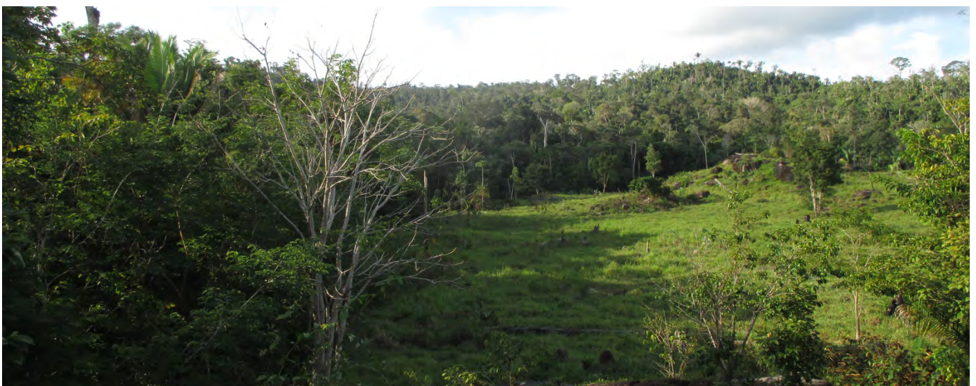
Border of the REDD project's area.

The Florestal Santa Maria REDD project (FSM-REDD) covers almost 70,000 hectares of the Brazilian Amazon and has sold carbon credits to offset programs for at least two airline companies: Delta Airlines and TAP. Yet behind this is an increase in deforestation in the region, a history of land grabbing, the use of certifications that no longer exist and unfulfilled promises to local communities.