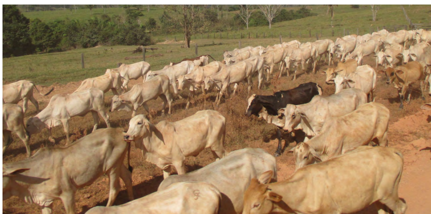
Cattle and pasture in Colniza region.

Still, on what happened between years 1975 and 1991, a period that is not mentioned in the report of the WSF-REDD project, residents of the region and also available documents point out that instead of colonization, what prevailed, as in other nearby regions, was gold panning 22 , and illegal activity that was at the same time very lucrative and destructive.