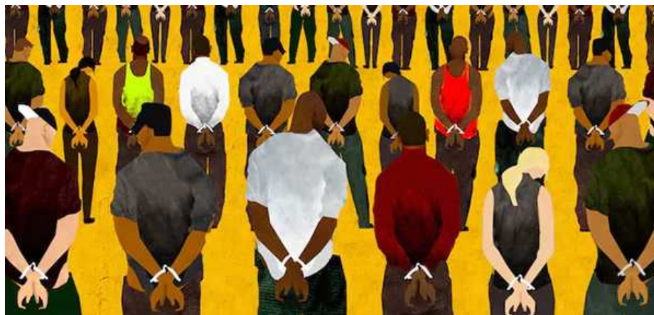
Illustration: Brian Stauffer, Human Rights Watch

What is a crime ? According to the dictionary, a crime is “an illegal act for which someone can be punished by the government.” But, then, what is considered “an illegal act”? And who decides?