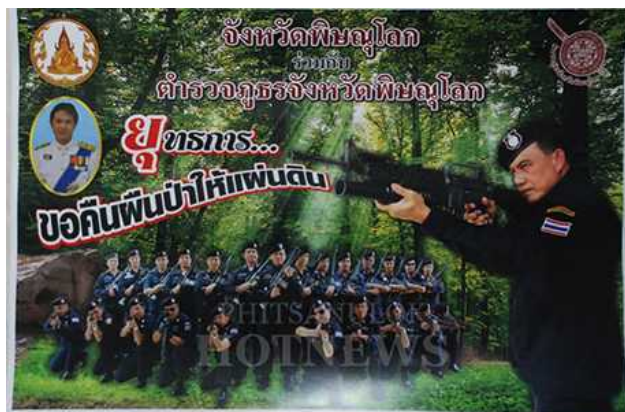
A state public relations poster from Phitsanuloke province: "return forests to the country."

Between 2014 and 2019, some 46,600 cases were brought against villagers for forest encroachment. At Chaiyaphum courts, for example, using the National Park Law, villagers have been imprisoned, evicted from their land, and had damages levied on them