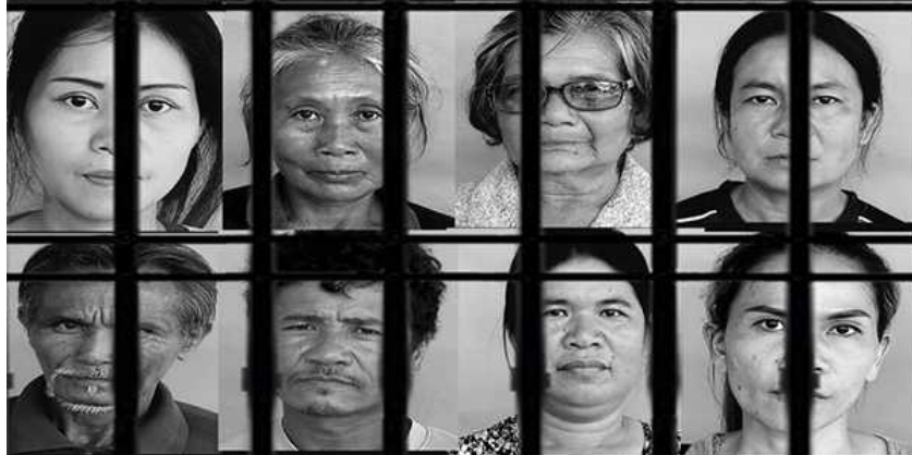
Villagers sued for trespassing of Sai Thong National Park Chaiyaphum Province, The court decides to imprison them and makes them pay damages to the state.

Available in Thai: กฎหมาย อาชญากรรม และการตัดไม้ทำลายป่าในพื้นที่ชนบทของไทย