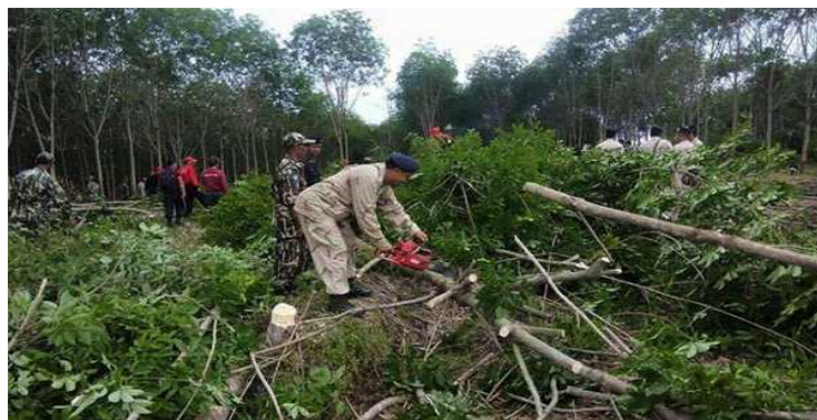
State officials remove villagers' rubber trees.

State officials justify these actions, and intimidate the rural people whom they target, by claiming that the villagers are actually capitalists or are being backed by big business.